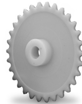
A 6M 7-3709