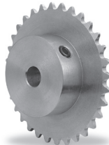
A 6C 7-25B09