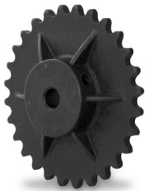
A 6T 7-2528